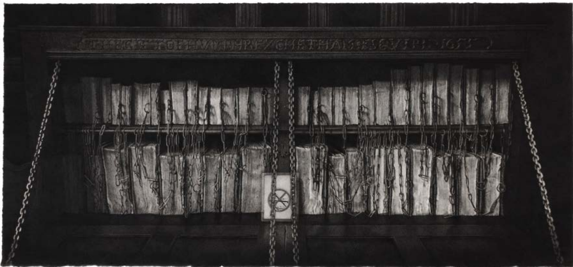
Yuriko Terazaki, Chetham's Library #1, 2024